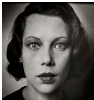
Tilly Losch, 1928

E.O. Hoppé is one of the most important photographers of the first half of the twentieth century. Celebrated during his lifetime, much of Hoppé's work has only recently been reassembled and this major survey will enable visitors to discover this forgotten master.