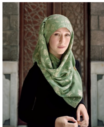
Wafa by Félix Carpio, 2010 © Félix Carpio

This major exhibition presents the very best in contemporary portrait photography. From a competition open to all, the exhibition features selected works by photographers from around the world.