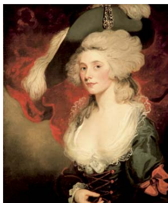
Mary Darby Robinson as Perdita by John Hoppner

First Actresses will explore the vibrant and sometimes controversial relationship between art, gender and the theatre in eighteenth-century England. Combining much-loved masterpieces with newly-discovered and little-known works, the exhibition will look at the ways in which actresses used portraiture to enhance their reputations, deflect scandal and increase their popularity and professional status.