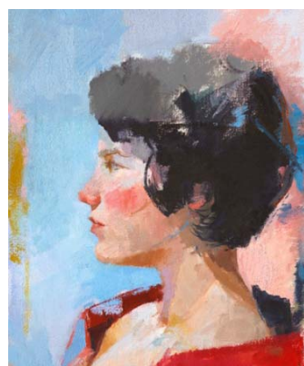
Geneva by Ilaria Rosselli Del Turco, 2009

16 June – 18 September 2011, Admission free