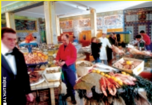
■ A L'HUITRIÈRE

EATING → BASKETS OF OYSTERS, BUCKETS OF CLAMS, TANKS OF LOBSTERS AND FLIPPING FISH.