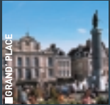
■ GRAND' PLACE