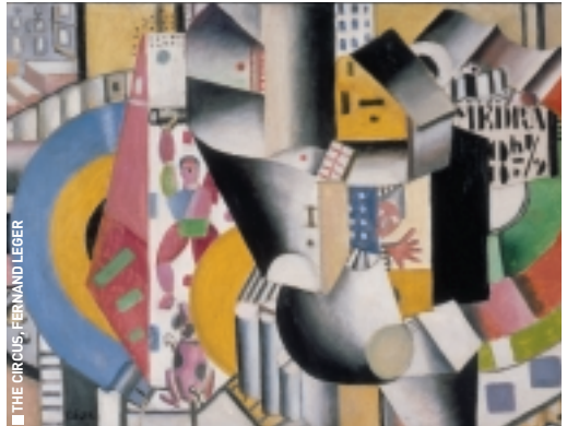
■ THE CIRCUS, FERNAND LEGER

DAY TRIPPING → THE METRO IS A DESTINATION IN ITSELF. THE WORLD'S FIRST UNMANNED UNDERGROUND TRAINS OFFER YOU THE CHANCE TO SIT UPFRONT AS YOU CAREER AROUND BENDS AND THROUGH DARK TUNNELS. PLONK YOURSELF AT THE FRONT OF THE FIRST CARRIAGE, AND CHOOSE BETWEEN THE PISCINE IN ROUBAIX OR THE MODERN ART MUSEUM.